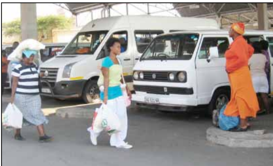
Commuters at the Nelspruit Plaza Taxi Rank