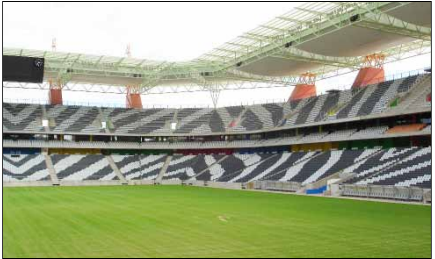
The Mbombela Stadium with a lush green world-class pitch