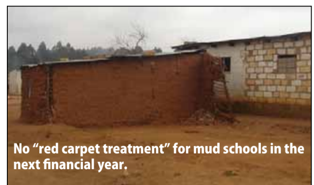
No “red carpet treatment” for mud schools in the next financial year.

be provided for legitimate learners; Recruited teachers will be paid a stipend.