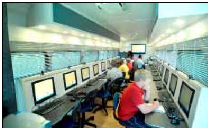
The "mobile training solution"

Called a "mobile training solution", the centre is essentially a converted bus fitted with computers in which skills training classes are held.