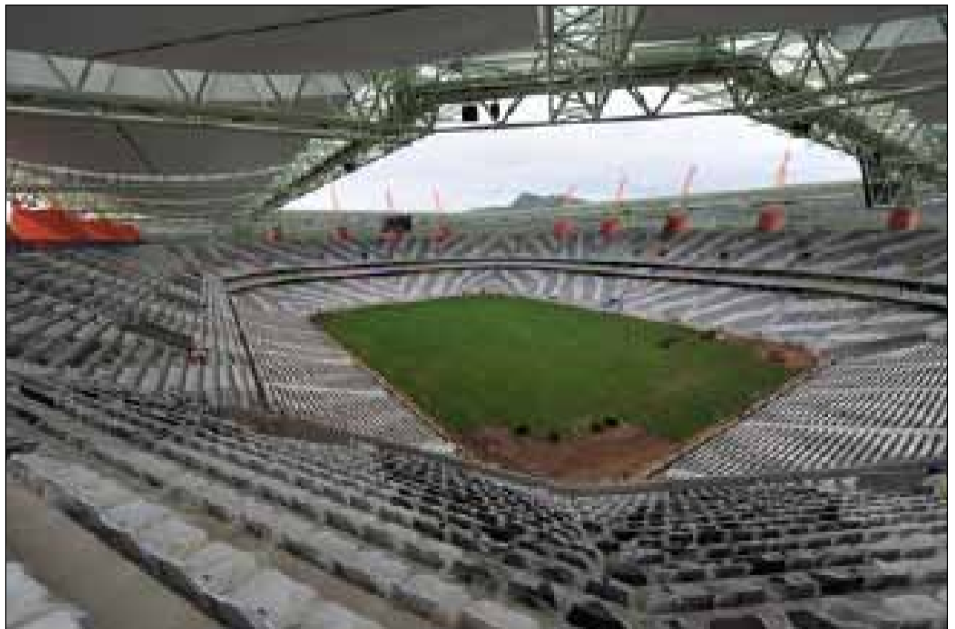
Mbombela Stadium - the venue for some of the FIFA 2010 World Cup games, including champions Italy

"During the roadshows we will also encourage people to ... show outsiders that Bafana Bafana is well supported," said Mphahlele.