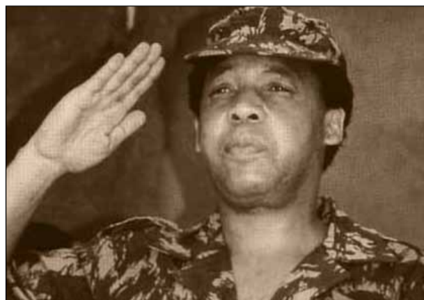
Chris Hani, murdered

I later discovered that this militant young man had enrolled, but could not complete his studies at Fort Hare University. He was at the forefront of the students struggles and earned the reputation and