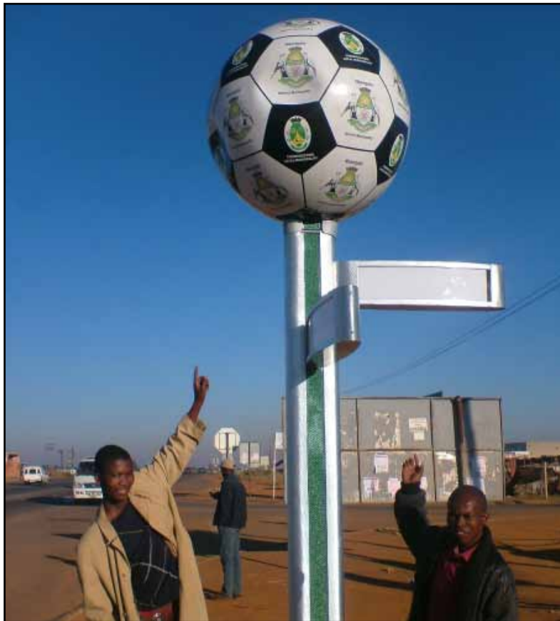
Angry residents believe that the soccer balls are "useless".