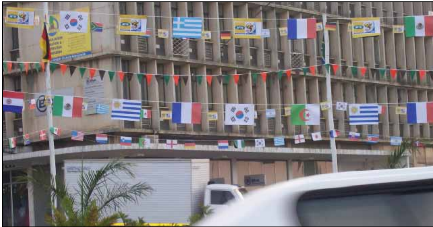
Residents in neighbouring Swaziland woke up to buildings in the capital of Mbabane having been draped in flags

"Parents must please tell their children that the World Cup tickets are not