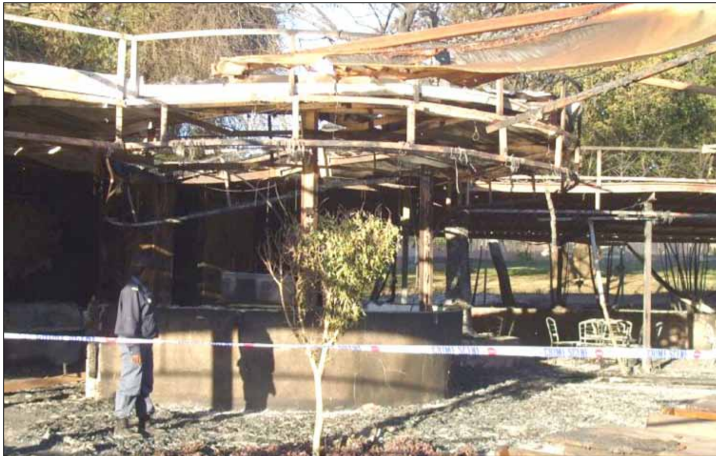
Matsamo's restaurant, which has been destroyed

"We think it may be a cooking fire that had been left unattended because we had several school tours that day that included food tasting," she added.