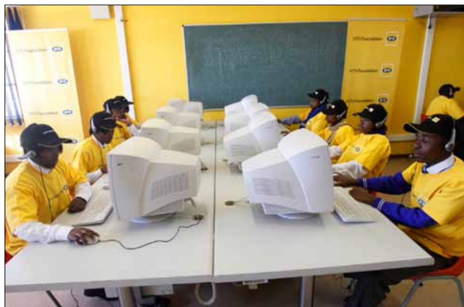
Pupils use the computers donated by the MTN Foundation at Engabezweni High School in Badplaas

in the foundation and accounts for almost half of the company's spend in each community. Projects in this focus area are closely linked to MTN SA's core business and focus on using technology to improve the standard and quality of teaching and learning," she added.