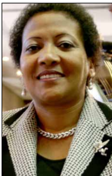
MEC for Finance, Pinky Phosa

"The local government intervened by holding a provincial economic summit last year where, among other things, it was agreed that we needed to fast-track financial support to small, medium