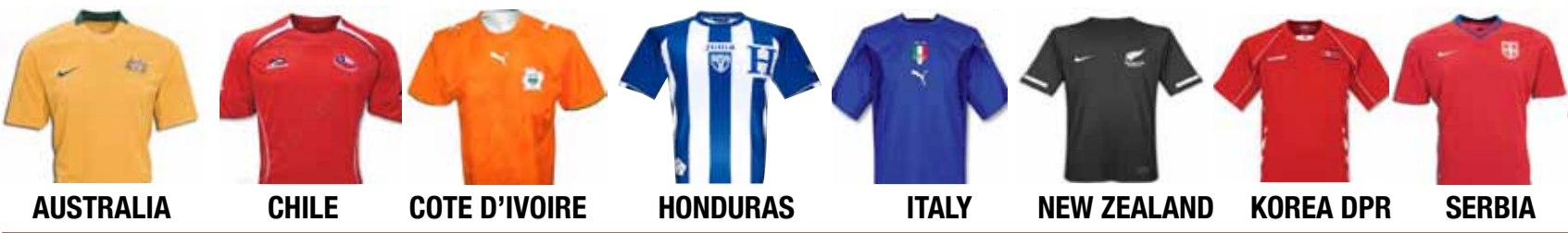
AUSTRALIA CHILE COTE D'IVOIRE HONDURAS ITALY NEW ZEALAND KOREA DPR SERBIA