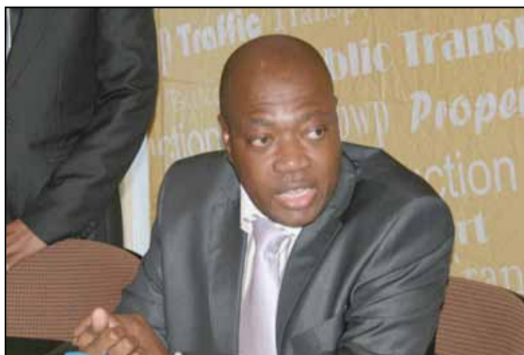
Mataffin Schools are ready for occupation

"The construction of the two schools have been finalised and are ready to use. Our department is now ready to hand over the schools to the client department, which is the Department of Education," said