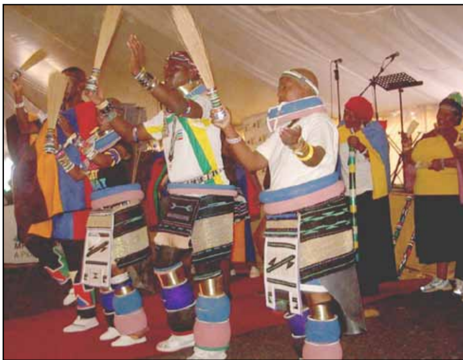
The Nyokeni Women's Club in their Ndebele attire came from KwaNdebele to entertain the crowd

"They succeeded because they assumed the spirit of unity, political and military coordination, diplomatic action and mutual support as a key factor for victory. The transformation of the OAU into the African Union (AU), signed on July 11 2000 by 53 heads of African states at Lomé in Togo, with the objective of strengthening the development of Africa, eradicating poverty and encouraging African integration into the global economy, came at the right time," she said.