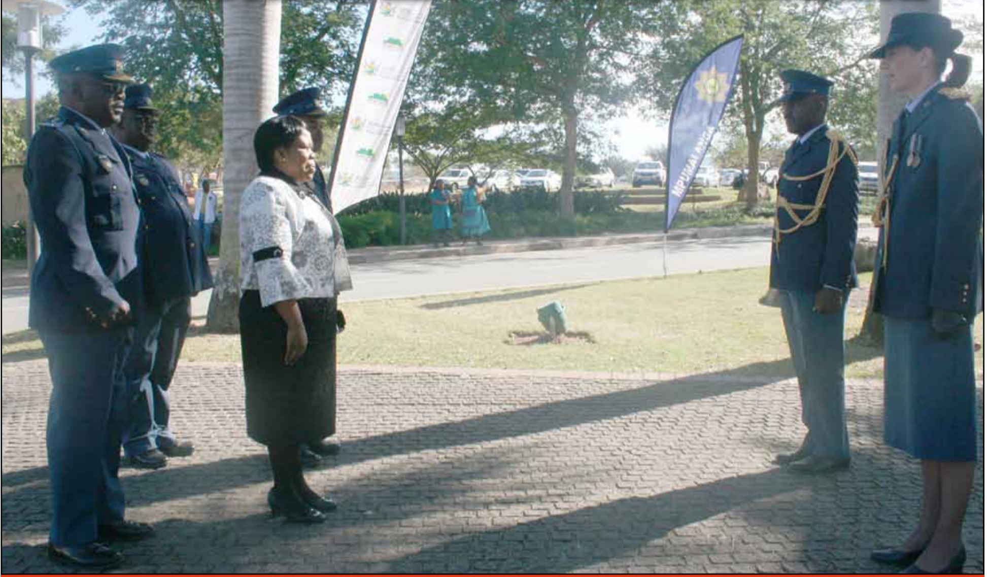
MEC FOR SAFETY AND SECURITY, TAKING A SALUTE BEFORE PRESENTING HER POLICY AND BUDGET SPEECH