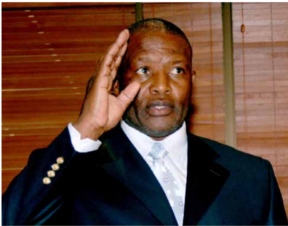
MEC for Agriculture, Rural Development and Land Administration

"Through the Comprehensive Agricultural Support Programme from the Department of Agriculture, Forestry and Fisheries and the newly introduced Recapitalisation and Development Programme from the Department of Rural Development and Land Reform, my department will continue revitalising irrigation schemes in Spoons 8, Magudu and Sibange in