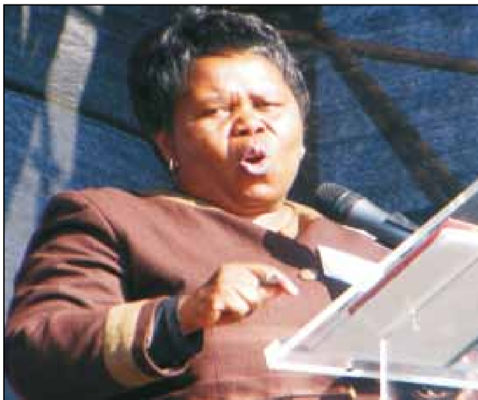
MEC for Safety and Security praised the police for moving swiftly to arrest the suspects

Information from the police revealed that the suspects had been found in possession of igniter cords, various firearms including an Uzzi, rounds of ammunition, cash with explosive residue on it, gloves, a crow bar and