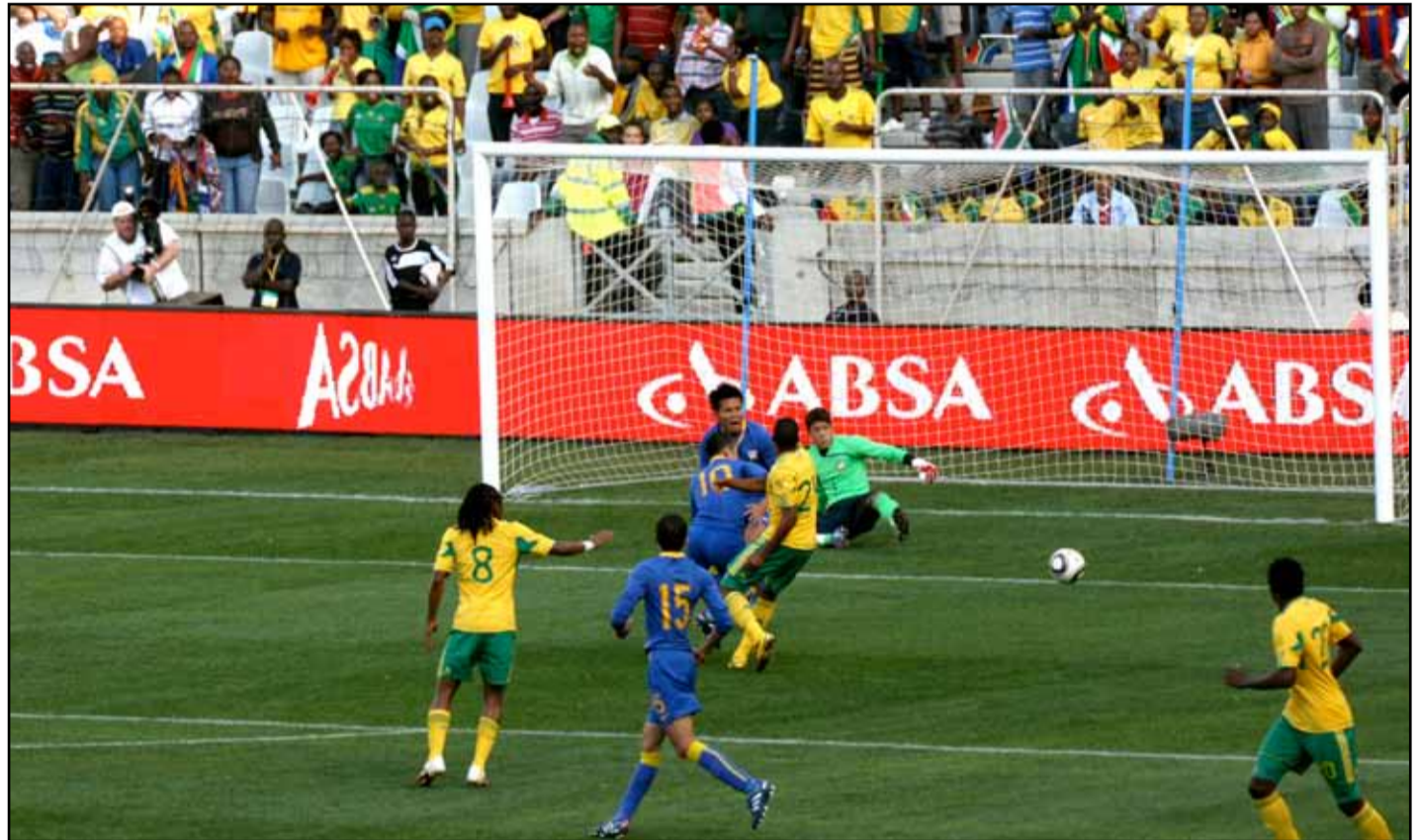
Bafana-Bafana raid the Thais goal posts for the umpteenth time

Siyabonga Nomvethé also impressed, after coming in as a substitute. He possibly is the remaining embodiment of the South African "flair" that many people are still wondering what it is.