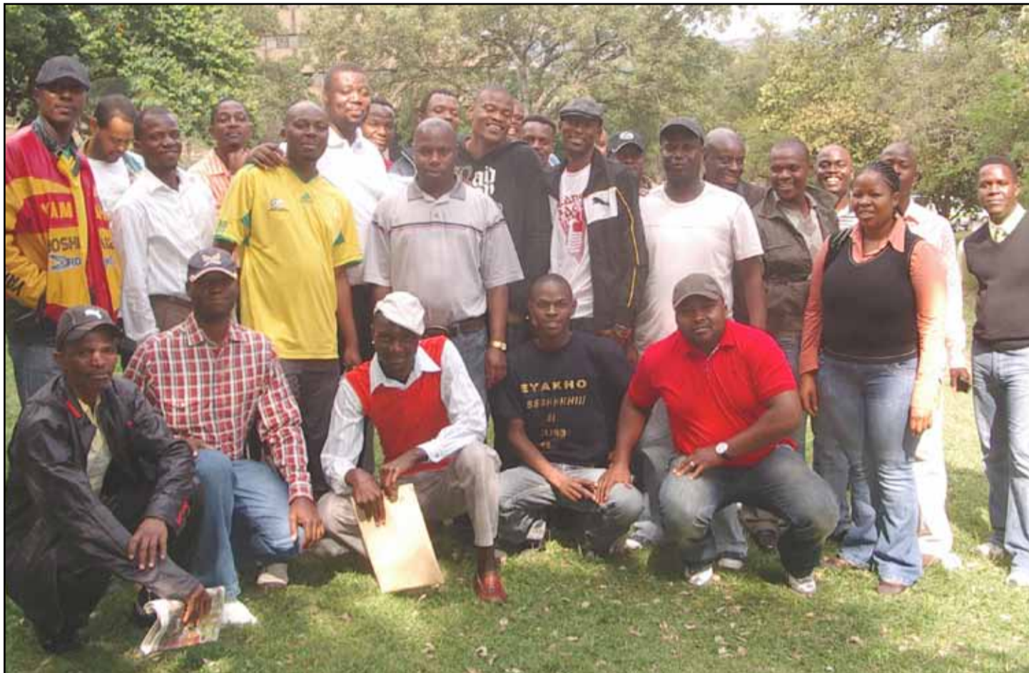
Mpumalanga artists outside the Mbombela municipality's offices last Thursday, where they had a meeting to raise concerns about being left out of all World Cup events in host city Nelspruit.

"He apologised and agreed that neglecting local talent had been a big mistake. We are happy now that both