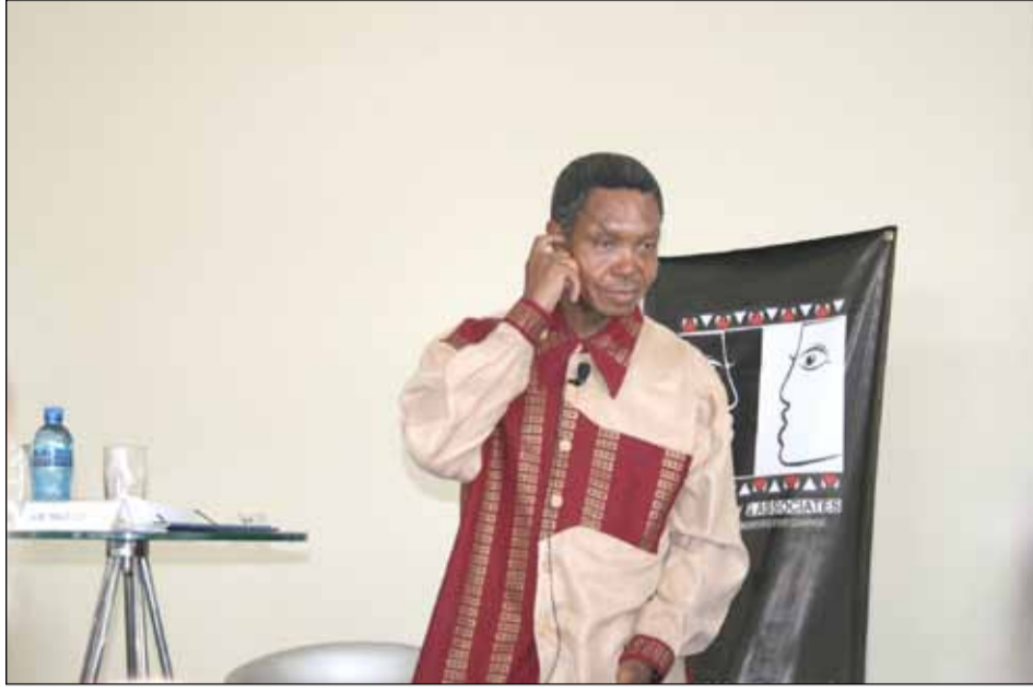
Press Ombudsman, Joe Thloloe

According to MMC's interim constitution, its objectives are to