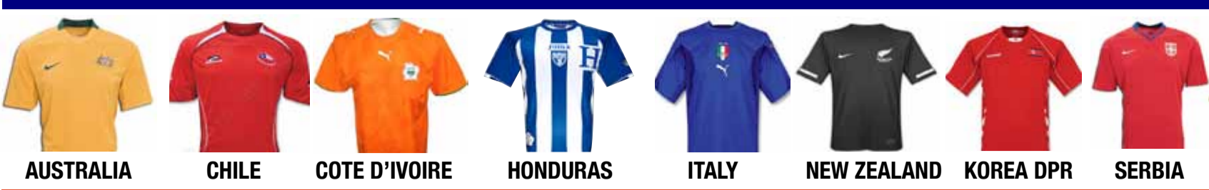
AUSTRALIA CHILE COTE D'IVOIRE HONDURAS ITALY NEW ZEALAND KOREA DPR SERBIA