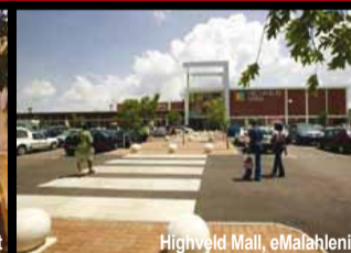
Highveld Mall, eMalahleni