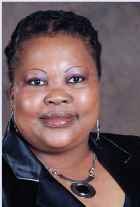
MEC Dikeledi Mahlangu

The rate in the Gert Sibande district has increased from 38.9% in 2006 to 40.5% in 2008, while Nkangala district's rate has increased from 26.8% in 2006 to 31.8% in 2008.