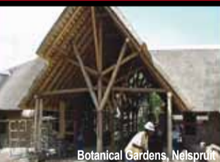
Botanical Gardens, Nelspruit