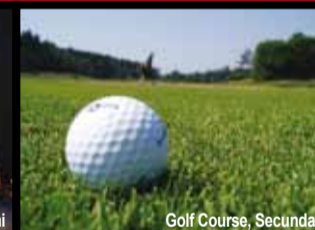
Golf Course, Secunda