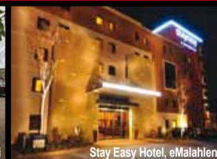
Stay Easy Hotel, eMalahleni