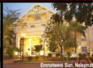
Emnotweni Sun, Nelspruit