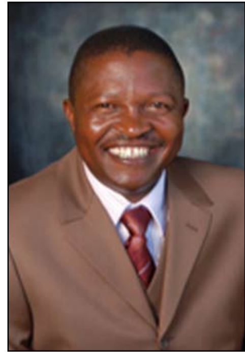
Mpumalanga Premier, David "DD" Mabuza

Mabuza said his office will this year establish a call centre that will capture, process and respond to issues that communities raise.