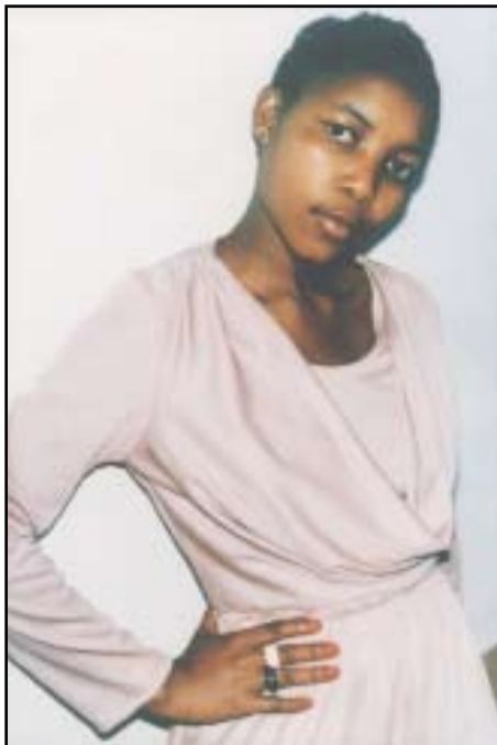
The statue of Nokuthula Simelane, an Umkhonto we Sizwe cadre who went missing in the 1980s, will be unveiled in September.

Mpatlanyane said the statue was part of a proposed R2,3 million cultural precinct that includes apartheid struggle hero