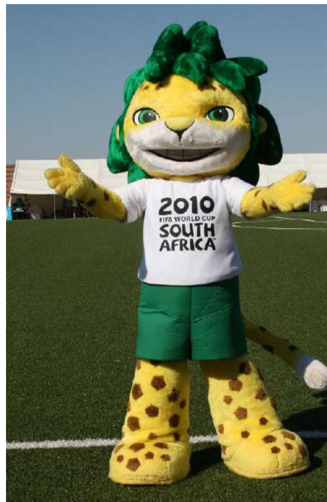
The kids' favourite, Zakumi

The province hosted three different road shows last week at Sakwela (Emakhazeni Municipality), Thandukukhanya (Mkhondo) and Thulamahashe (Bushbuckridge) where the official FIFA mascot Zakumi made another appearance and proved to be a hit with children.