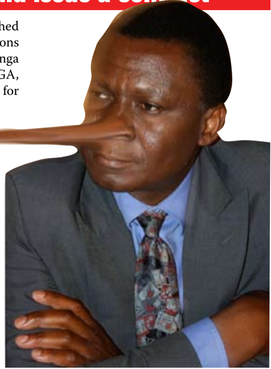
He said there was no IT contract, the minutes prove otherwise

Minutes of a meeting which the COO attended reveal that MEGA did issue a contract