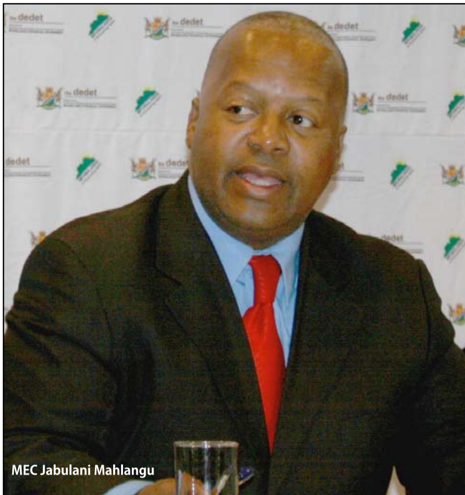
MEC Jabulani Mahlangu

The first few paragraphs of MEGA's press release emphasizes that MEGA has zero tolerance to fraud and corruption. It trumpets that MEGA is an organization characterized by ethos of honesty and integrity. It also promises to provide accurate "facts", to "set the