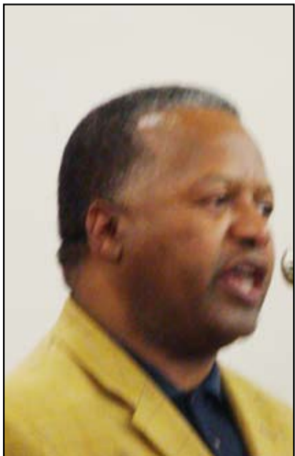
MEC for Economic Development, Environment and Tourism Jabulani Mahlangu

Three licences are still to be awarded, one in Limpopo, one in Mpumalanga and one in the Eastern Cape.